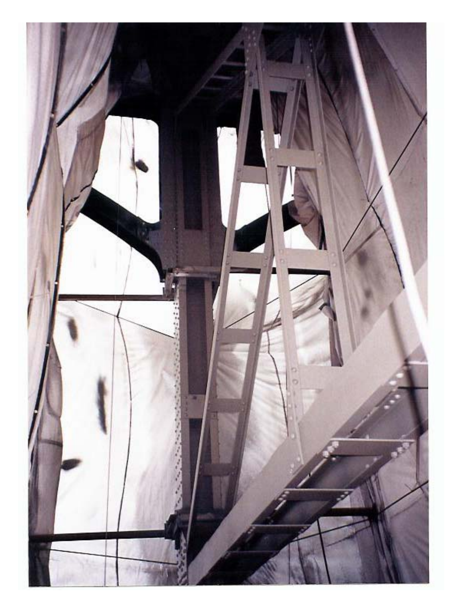
Containment To Grade