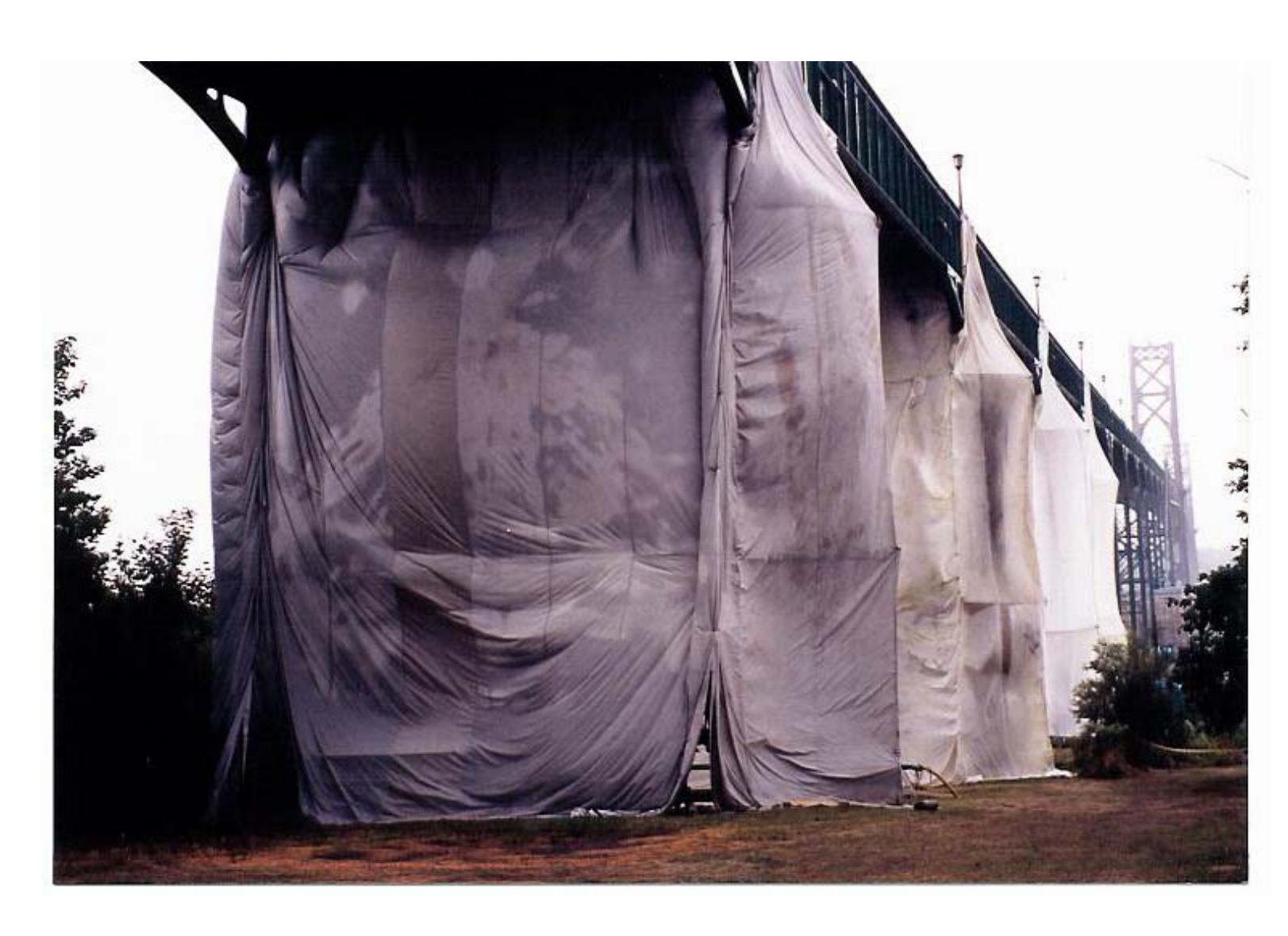
Containment To Grade