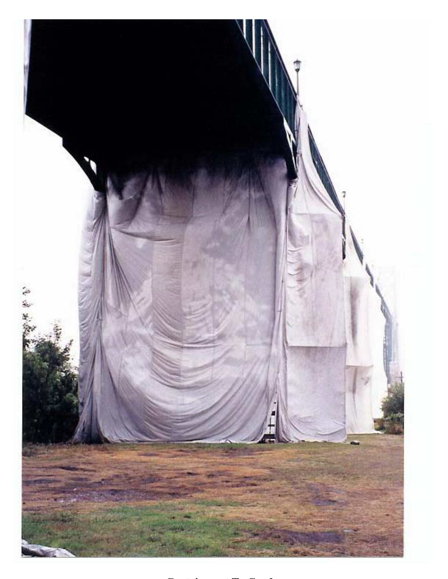
Containment To Grade