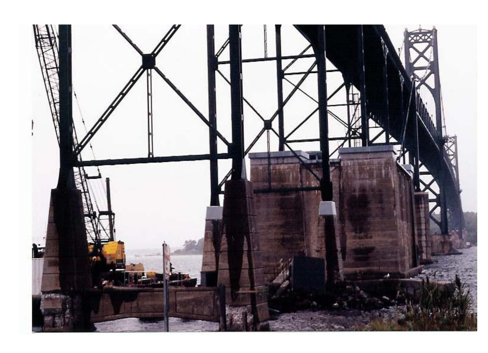
Mount Hope Bridge

PROJECT DESCRIPTION: Blasting & Painting Project Main Span & Anchor Spans